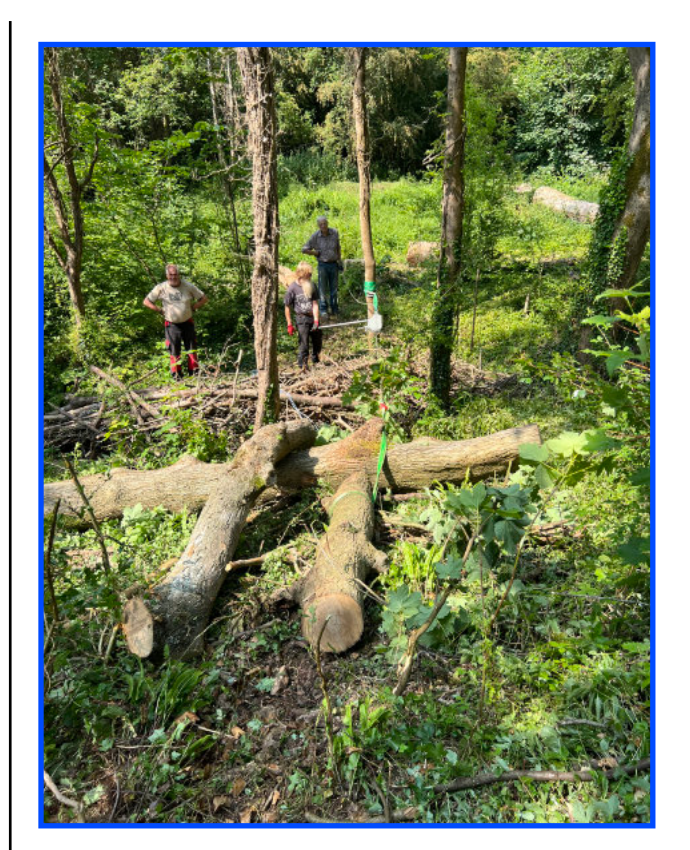
Winching the felled trees down the hill for logging